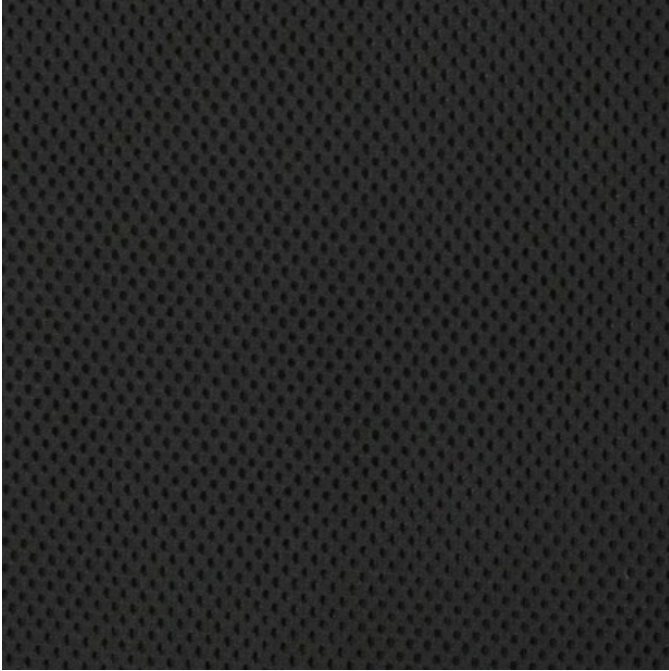
Zodiac Mesh, 2300 Scorpio