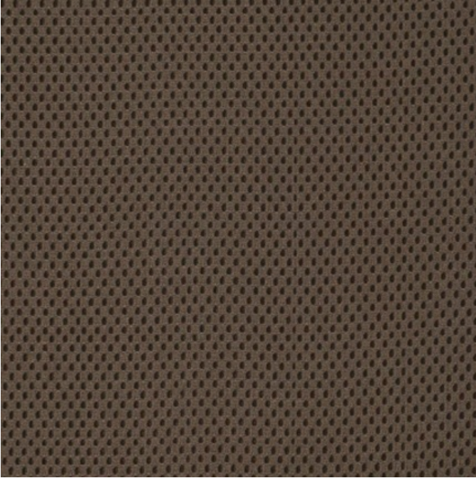
Zodiac Mesh, 2303 Taurus