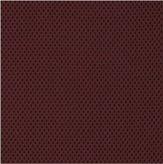
Zodiac Mesh, 2309 Sagittarius