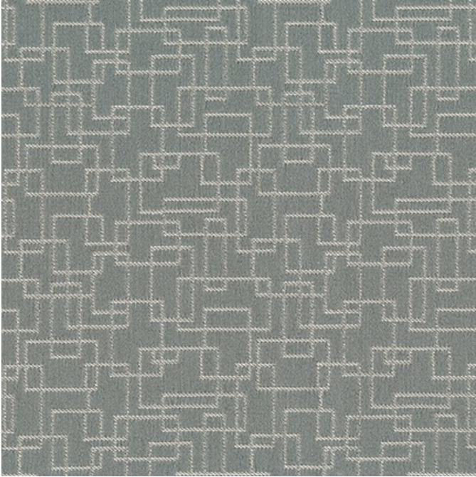
Track, 2712 Silverstone