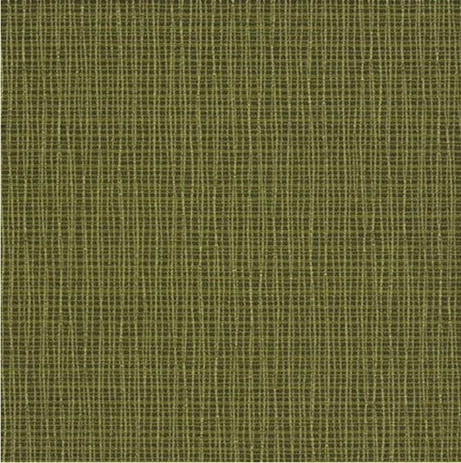
Bliss, 3908 Bouquet

Content: 75% Repreve® Post Consumer Recycled Polyester; 25% Polyester