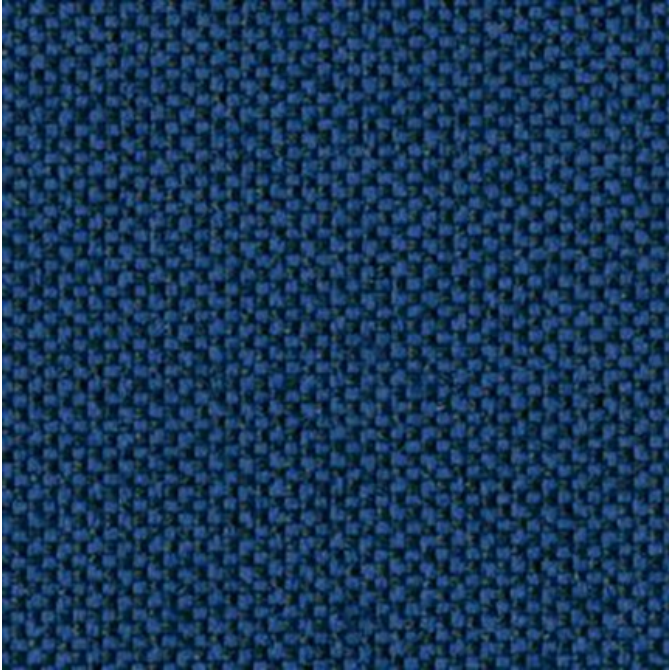
Rocket, 4504 Navy

Content: 27% Polyester, 73% Recycled Polyester