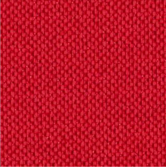
Rocket, 4507 Flame

Content: 27% Polyester, 73% Recycled Polyester