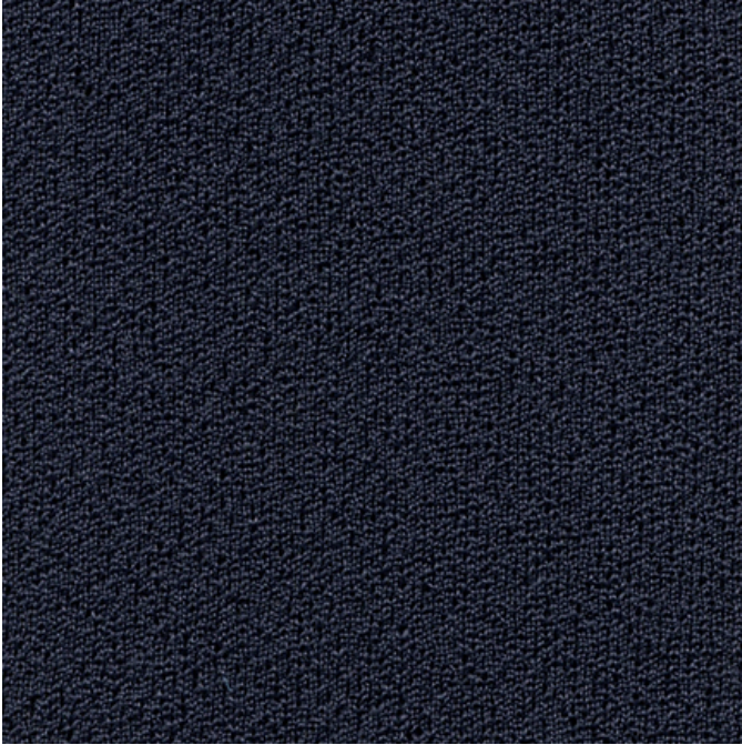
Comfortknit Solids, 5502 Monarch