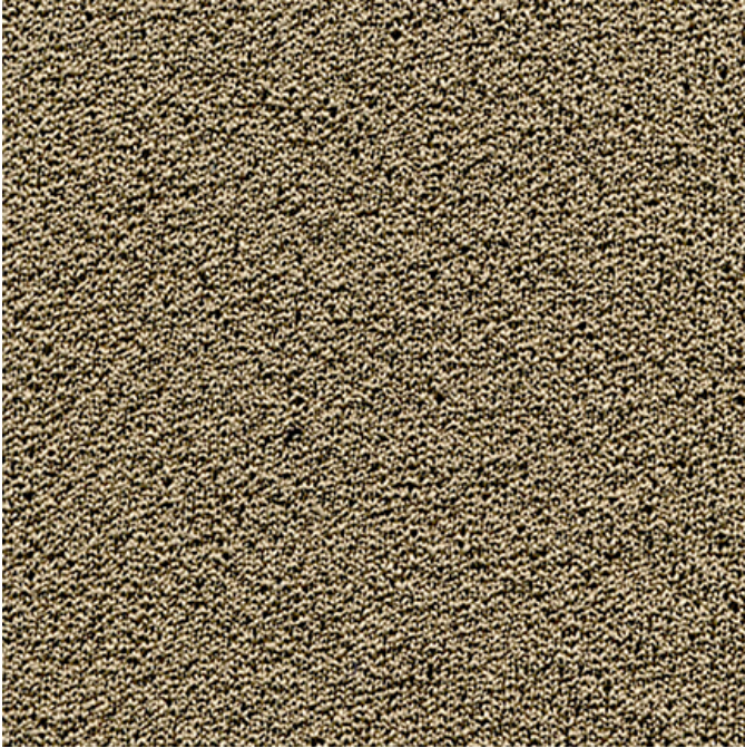
Comfortknit Solids, 5506 Cappuccino