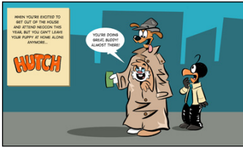
07 | Hutch Industry Cartoon