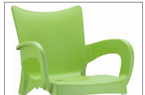
99 FIRST LOOKS Shev Chair Introduces The Verona Series