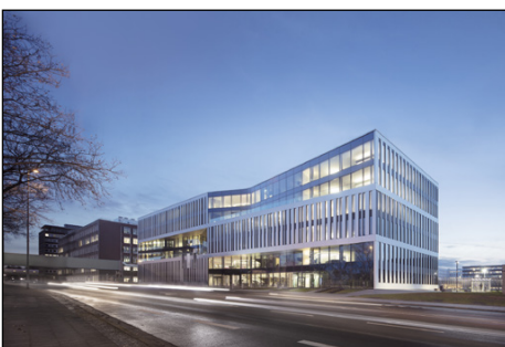
66 PLACES Covestro Headquarters – Leverkusen | Arriving at the atrium, both the atmosphere and the interior composition project innovation.

The modern building reflects Davis' modern furniture. That starts at the front of the building with its 12-foot high windows.