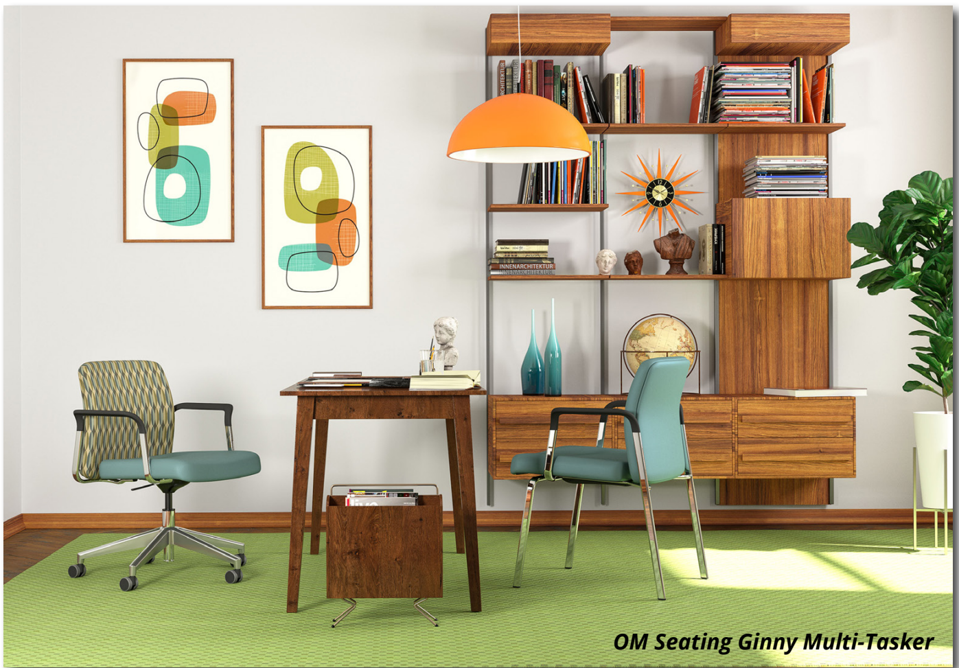
OM Seating Ginny Multi-Tasker

Offering a myriad of options and areas for different kinds of work requires space utilization efficiency and mobility. Artome's M10 portable, plug-and-play smart solution for presenting, learning and videoconferencing, delivers movable and adaptable audiovisual technology whenever and wherever it is needed.